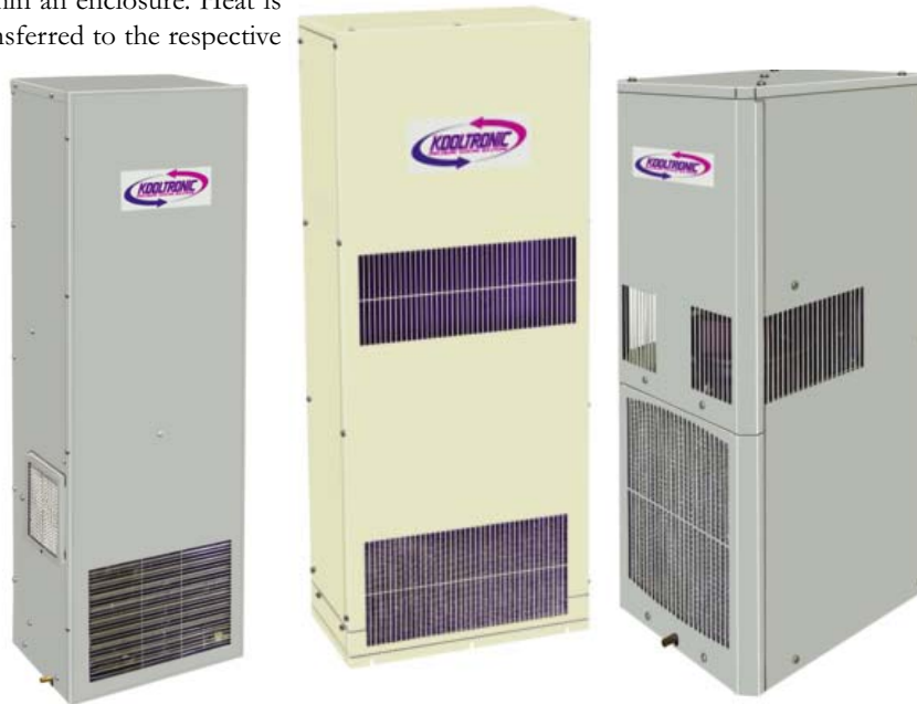
Figure 2. Enclosure cooling air conditioners typically carry agency markings such as UL, which designates the environmental hazard from which the contents are being protected. This marking should be matched to the enclosure to be cooled. Typical examples include NEMA 12 (left), NEMA 3R middle and NEMA 4X (right).

The thermostat has a differential setting that is typically 12 to 15°F (7 to 8°C) above the low-limit setting. When the air circulated within the enclosure rises by this amount, or at about 90°F (32°C), the compressor and condenser blower turn back on, reducing the enclosure internal air temperature once again. Therefore, at startup of an enclosure system, it would be normal