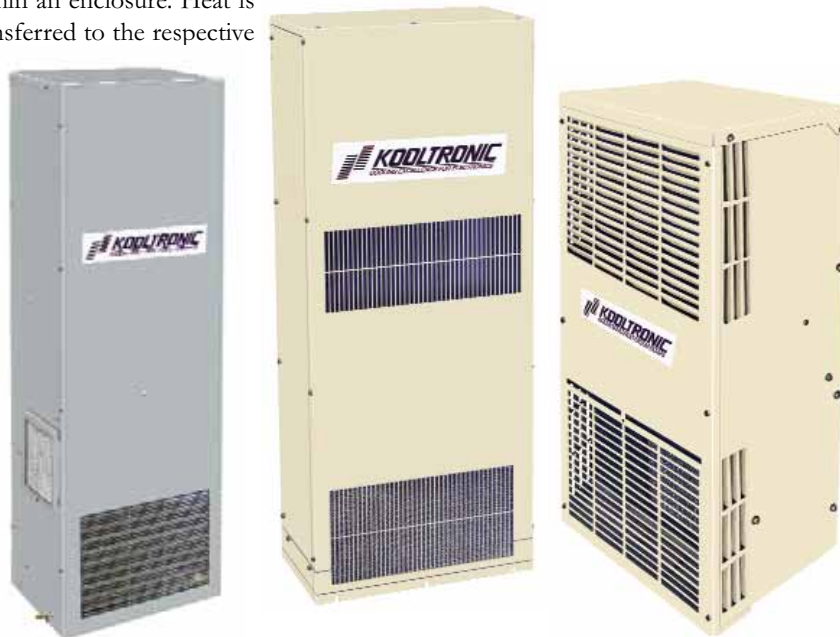
Figure 2. Enclosure cooling air conditioners typically carry agency markings such as UL, which designates the environmental hazard from which the contents are being protected. This marking should be matched to the enclosure to be cooled. Typical examples include NEMA 12 (left), NEMA 3R middle and NEMA 4X (right).

The thermostat has a differential setting that is typically 12 to 15°F (7 to 8°C) above the low-limit setting. When the air circulated within the enclosure rises by this amount, or at about 90°F (32°C), the compressor and condenser blower turn back on, reducing the enclosure internal air temperature once again. Therefore, at startup of an enclosure system, it would be normal