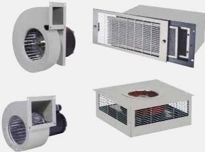
Basic Blowers and Packaged Blowers