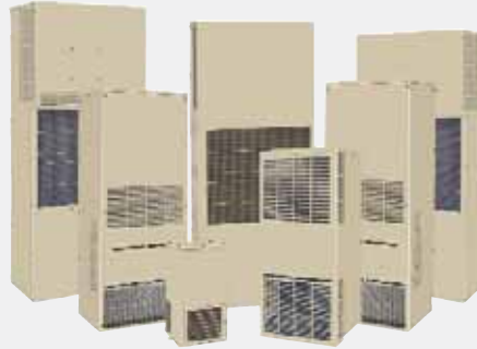
NEMA 4 or 4X Air Conditioners (480 Volt models available)