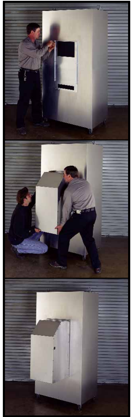
Unique Mounting Template and Assembly Bracket (M/TAB) for quick, easy installation.