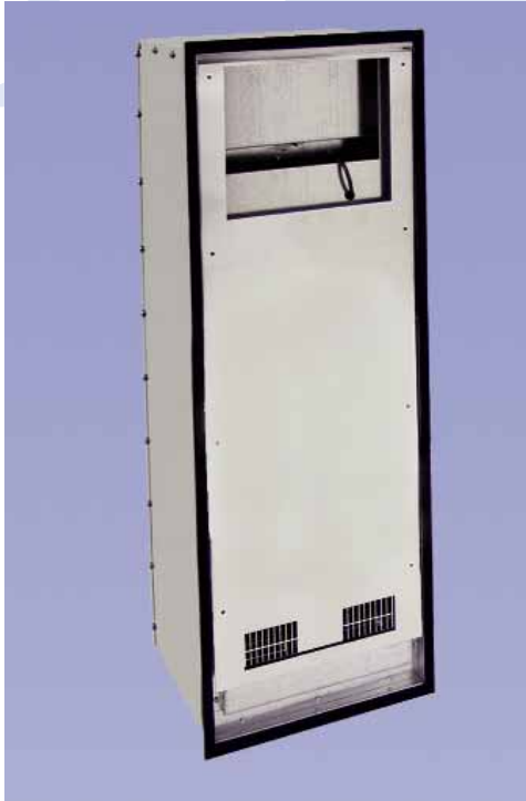
Gasketed flanges on all four mounting edges for a positive leakproof seal.