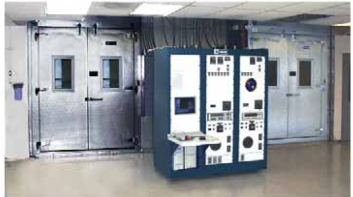
Kooltronic's experienced professionals are ready to help you at any phase of your project, from conception to prototype testing.