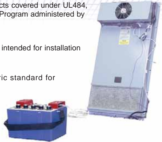
Heat exchanger undergoing a motor test.

The Underwriters Laboratories Client Test Data Program - This program allows us to test and submit the data collected to UL for product approval. To qualify for this program our testing facilities and procedures are audited annually via a field inspection by an authorized UL representative.