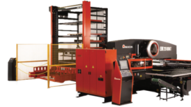
EM Turret with PRIIUL300