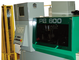
Tube Forming Machine

If your company needs copper tube fabricated for assembly or sub-assemblies, KOOLTRONIC is your complete source. We currently undertake tube fabrication and bending jobs for many major industries. We can shape 1/8", 1/4" & 3/8" & 1/2" outer diameter copper tubing. For 1/4", 3/8" and 1/2" tubes, one end can be expanded (swage) to receive the outer diameter of the same tube, reducing the need for a fitting.