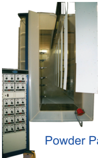
Powder Paint Booth

Offers a variety of coatings and colors. Call us for your custom color needs. All powder-coated parts are run through our five-stage pretreatment system to ensure adhesion and superior corrosion resistance. As a "green" step, KOOLTRONIC utilizes a closed-loop wash system that reclaims particulates and prevents their release into the environment.