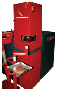
Corner Forming Machine

Our state-of-the-art EdgeMaster 100 corner forming machine is capable of producing custom trays and pans with rapid turn around time. This unique process forms corners to produce a pan shaped part from a solid rectangle of metal, eliminating welding and finishing. Cold rolled steel up to 0.125 inches can be formed in almost any combination of flange bending radius and actual corner radius. Aluminum and other formable alloys may also be processed.