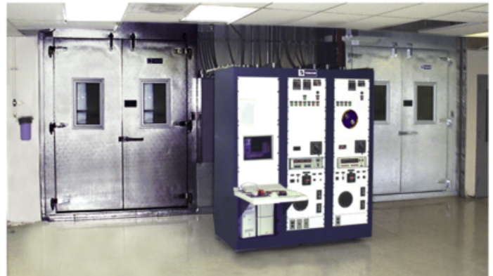
Kooltronic's experienced professionals are ready to help you at any phase of your project, from conception to prototype testing.