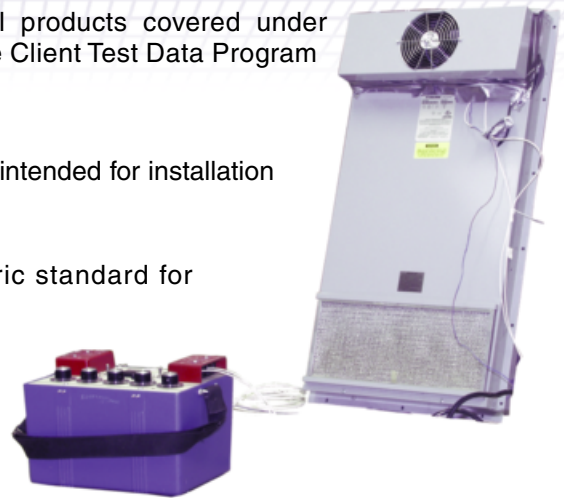
Heat exchanger undergoing a motor test.

The Underwriters Laboratories Client Test Data Program - This program allows us to test and submit the data collected to UL for product approval. To qualify for this program our testing facilities and procedures are audited annually via a field inspection by an authorized UL representative.